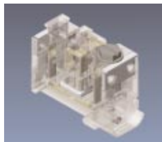
Cricket Terminal Blocks with interchangeable bridge module and standard 5-pin footprint to accommodate gas tube, hybrid or solid state protection.