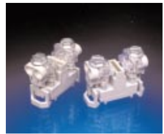
Termcon Terminal Blocks with 3-pin footprint in an always closed position - no bridge module required to complete circuit.

WPT TM Western Pacific Telecommunications